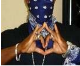
How to identify gang associations, gang graffiti etc. . . .

This one day seminar is designed to provide information on Gang Identification and Affiliation, Gang Safety, School Searches and Identifying, Questioning and Evaluating the Criminal Courier. Training will be provided on how to identify gang associations, gang graffiti and gang identification within the northern Ohio area. In addition, training will be provided on safety issues when law enforcement officers encounter gang suspects. Training will also be provided on Fourth Amendment Search & Seizure issues related to school searches, to include a review of school student locker searches, canine sniffs in schools and vehicle searches in school parking lots. Finally, a review of how identify, question and evaluate suspects stopped for traffic violations who may be involved in criminal courier activities will be provided.