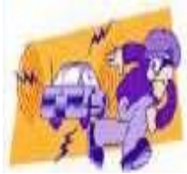
use of bait cars. .

This one (1) day seminar is designed to guide and direct the patrol officer or detective in understanding the highly complicated and sophisticated methods of auto theft in the United States. Auto theft is a national crime problem that involves millions of dollars in fraud or theft losses to individuals and the insurance industry. Many law enforcement officers receive little or no training on how to identify and investigate auto theft cases. This training program will enhance your awareness in auto theft investigations and the identification of possible stolen motor vehicles. Discussion will be provided in the technological aspects of auto theft by discussing the most current technology utilized by auto theft offenders and the technology available to law enforcement personnel to combat this problem.